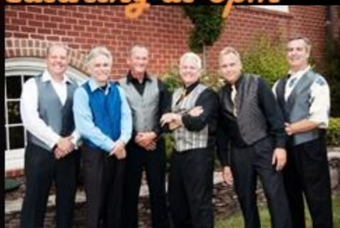
SPECIAL OCCASION BAND (SOB)